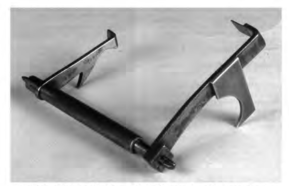
Fig. 3. Single striking arbor of the Haywood clock, with just two levers. The front one has a brass lifting piece and the warning detent; the rear lever has the locking detent and countwheel detent.

Abbot, the bell being dated 1751. He moved from Aveton Gifford to Totnes sometime in 1729. Hence he was using a countwheel with raised projections (on a turret clock) by 1723 and the pin countwheel (on a longcase clock) before 1730.