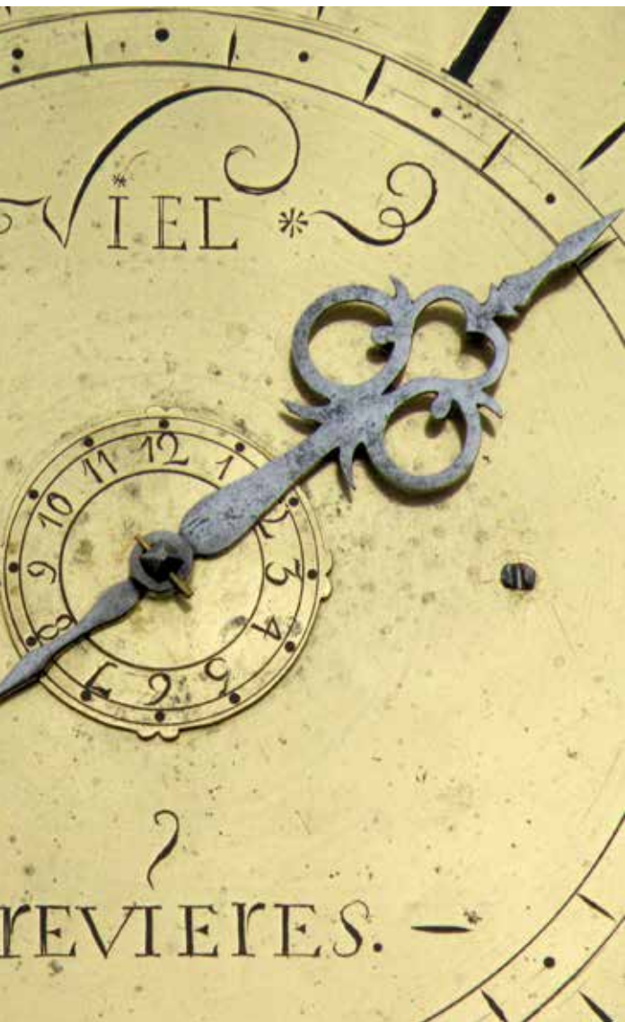
Figure 22 (above). Close-up of the maker's name.

carcase and a long slim panelled trunk door that appears to be pine that was originally stained. It hinges on the left, compared to an English country case which usually has a single plank of wood with hinges on the right. There is a tall base and wide overhanging mouldings on the top of the hood, but it is the hood construction that is unusual, figure 28 . The hood is integral with the trunk and is not removable and, as well as the usual opening glazed door at the front, there is another one on the right-hand side. Not only that but they both have iron, not the usual wooden, frames, which enable larger sheets of glass to be used, the window at the front being about 10in (25cm) wide. These two doors fill the whole width of the front and side so, to support the superstructure of the hood, there is a vertical square-section iron rod at the front right-hand corner.