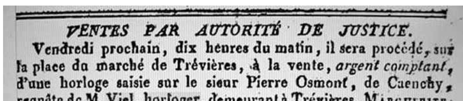
Figure 23. The only known record of Mr Viel, clockmaker of Trévières.

The brass bushes may be original, or at least like-for-like replacements. All the wheels are brass with an iron rope pulley. There is an anchor escapement and it runs for a day with a single drop, although the current owner has added a weight pulley to halve the drop and double the duration.