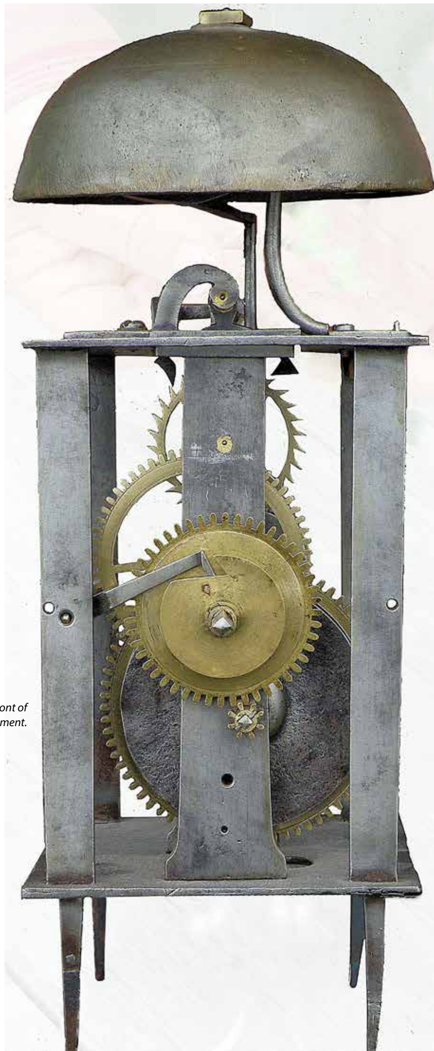
Figure 24. Front of the movement.

While there is no problem inserting the movement in through the front door, access to hang the pendulum is very restricted and this is the main