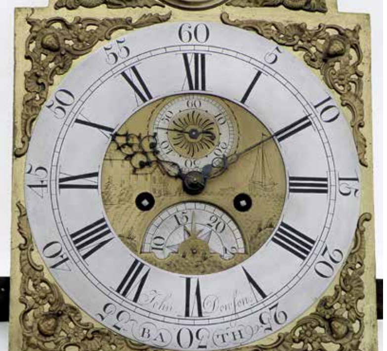
Figure 6. The Bristol-made dial of the Dowson clock.

Since prehistoric times the warm mineral springs at what is now known as Bath have been highly regarded for their healing properties. A major Roman town, Aquae Sulis, was built over the site, but after they left Britain it was little more than a market town until the early eighteenth century. It then became a genteel and