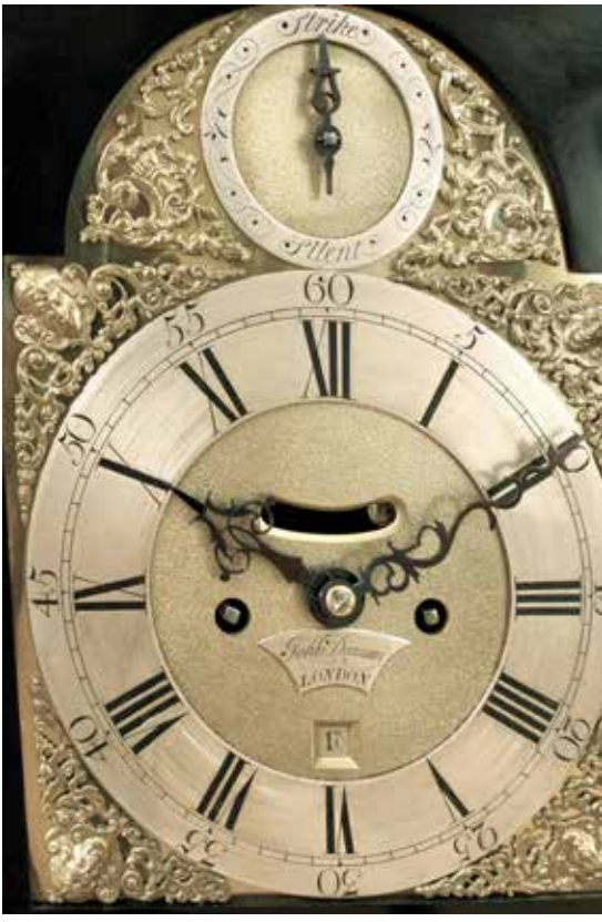
Photographic captions, left to right

as well as in Bath, Somerset, where he also traded as Dowson & Atkinson. These are all the same man, but there is no connection with Dowson & Atkinson, wharfingers in Southwark, London. While some details of his