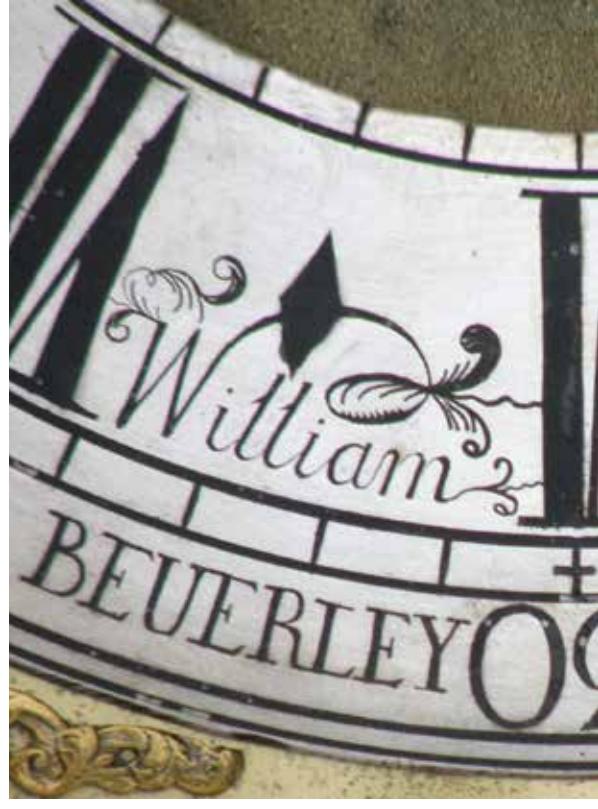
Figure 2 (above). Detail of the name on the chapter ring.

Figure 1 (left). Dial of an eight-day longcase clock by William Mainman of Beverley, about 1740-50.