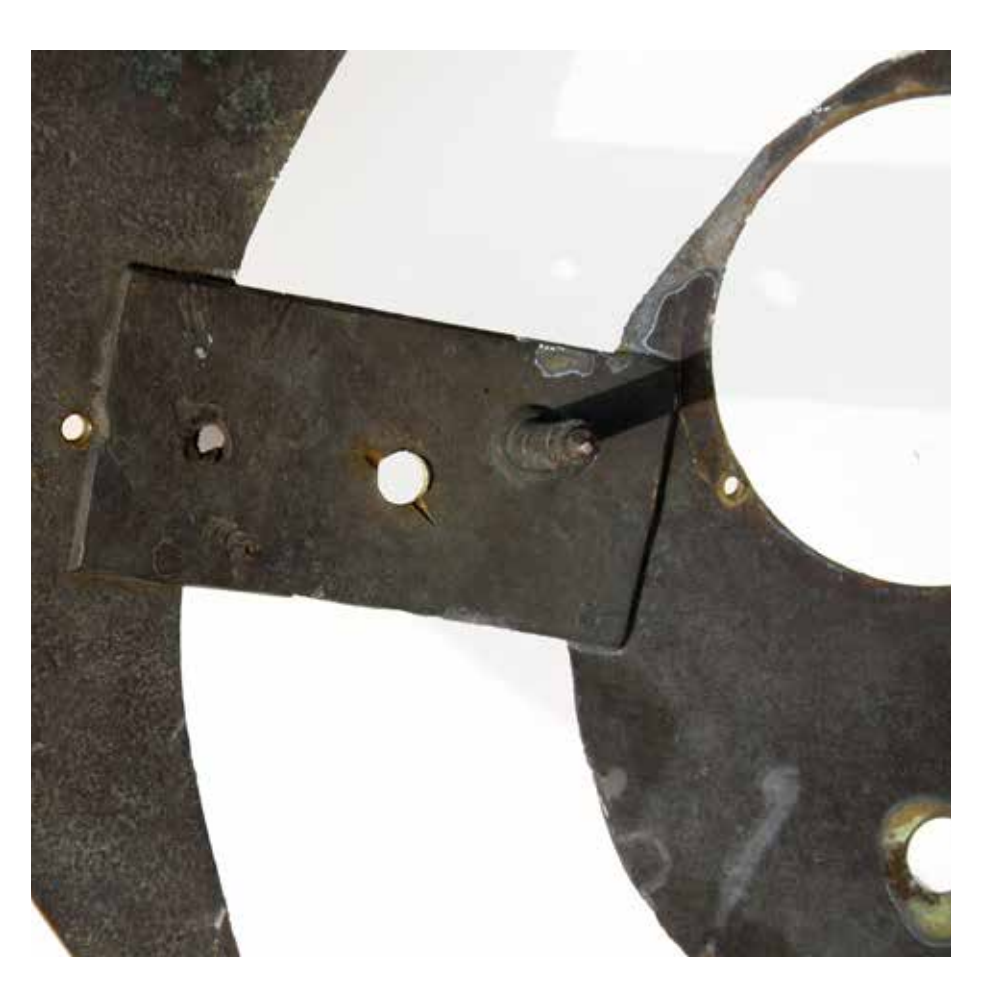
Figure 6. Outer part.

• The third type, like the heart moon, shows one lunation per revolution, but it is less realistic. The disc shows a full moon and opposite it is a black starry circle indicating when there is no moon visible. This 'no moon' was known as 'the dark of the moon'. This type of penny moon, especially when it was above the centre of a square dial, was particularly popular with clockmakers in north Cheshire and south-west Lancashire. On painted dials the dark moon is sometimes a deep blue. It has been suggested, incorrectly, that this is the origin of the