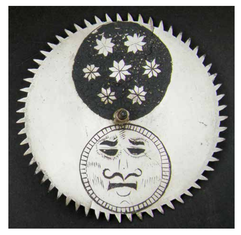
Figure 4. The moon disc has a full moon and a 'dark of the moon', with 59 teeth round the edge.

movement, hands or case) that was acquired for a modest sum, purely as a decorative artefact, but proved interesting enough to write this article about it. Unfortunately, in my eagerness to clean the blackened chapter ring, matting and partly corroded dial plate, I omitted to photograph its 'as was' state.